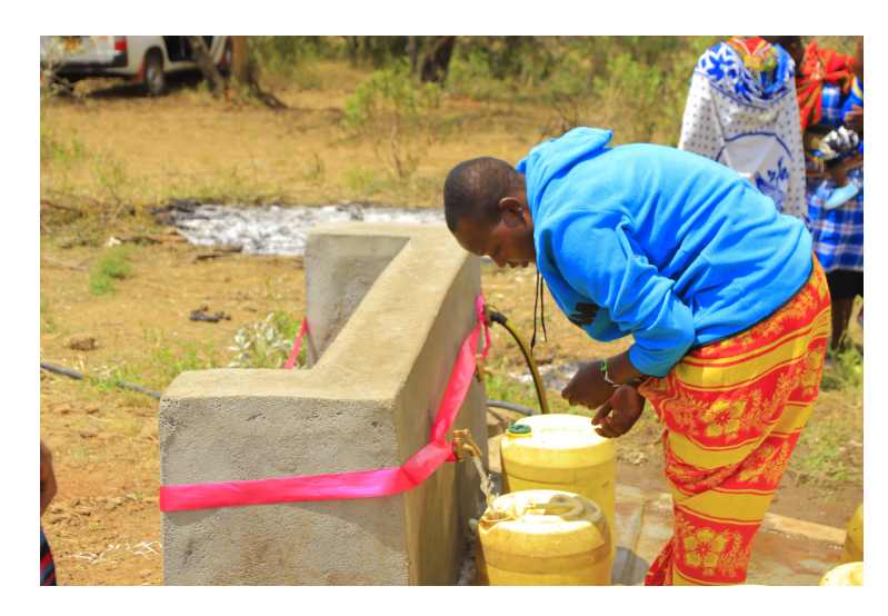
One of the first women in her village to experience fresh water from a faucet at the well dedication in Ildungisho, Masai Mara, Kenya.

Investing in well infrastructure is a crucial step towards achieving sustainable development goals and uplifting communities in need.